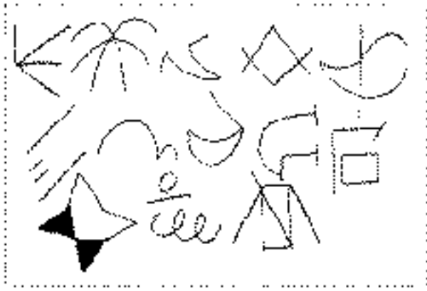
Figure 1. Line drawings of abstract figures